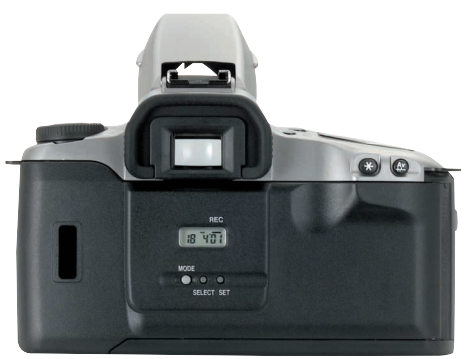
EOS 3000N date model also available